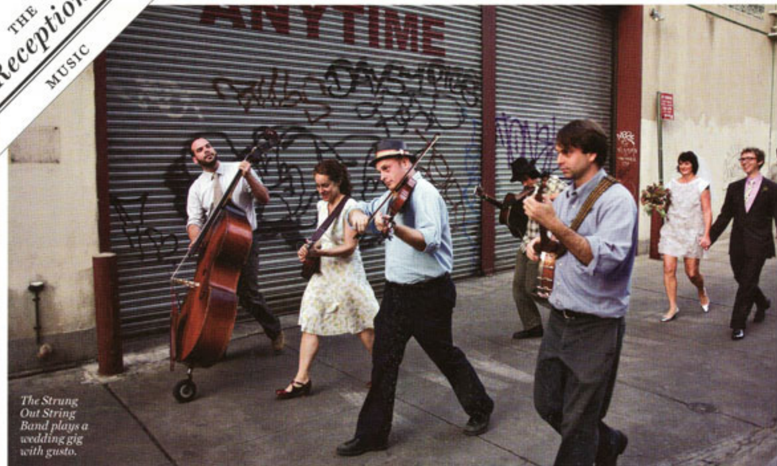
The Strung Out String Band plays a wedding gig with gusto.